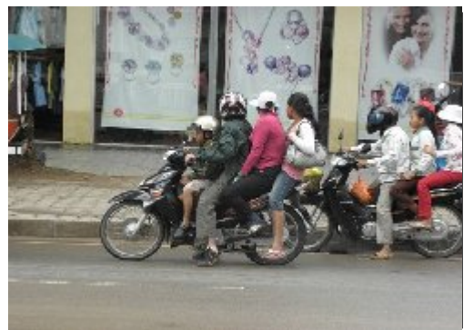
Transport in Siem Reap

Future travels 2010 will be New Zealand— Australia—Bangkok—Shanghai for World Expo. Back to UK before heading to Spain to collect Mercie and returning to UK for hopefully a good summer....and a trip to Ireland