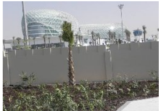
Yas Island Race circuit

Abu Dhabi has just completed a fantastic new motor racing track and opens it with the last Formula 1 race of the season. We rented a car and drove in about 1h40m to the park and ride, jumped on the free bus service and were driven some 5km to Yas Island where the new circuit is. We enquired about buying tickets but it was a sell out. They marketed them at around 370 pounds for a 3 day pass with concerts by Beyonce, Jamoraquai and Kings of Leon, tickets for children were the same price. Ticket touts would have had difficulty (good) as the tickets are chipped and you have to show ID. We walked around and everyone was shocked we had got to the island without tickets! Seeing the enormity of it all just being created from flat desert was amazing. The photo shows the hotel that bridges the track – note how recently it has been completed. The LED roof lighting is amazing.