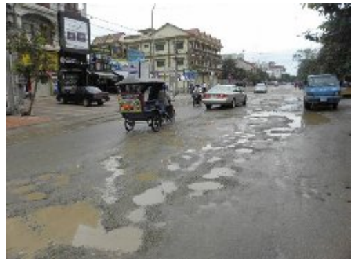
Siem Reap Main Street