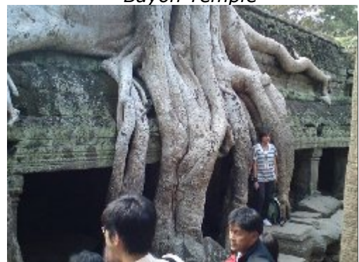
Kapok trees—massive damage

Future travels 2010 will be New Zealand— Australia—Bangkok—Shanghai for World Expo. Back to UK before heading to Spain to collect Mercie and returning to UK for hopefully a good summer....and a trip to Ireland