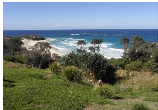
Kapok trees—massive damage

Future travels 2010 will be New Zealand— Australia—Bangkok—Shanghai for World Expo. Back to UK before heading to Spain to collect Mercie and returning to UK for hopefully a good summer....and a trip to Ireland