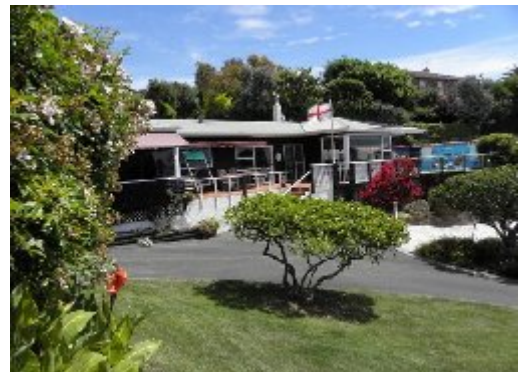
" The Cut "