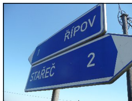
We didn't go!