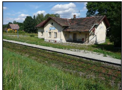
Nearby station - few trains