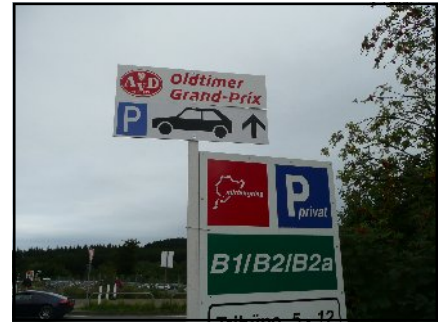
Nurburgring (S of Cologne)