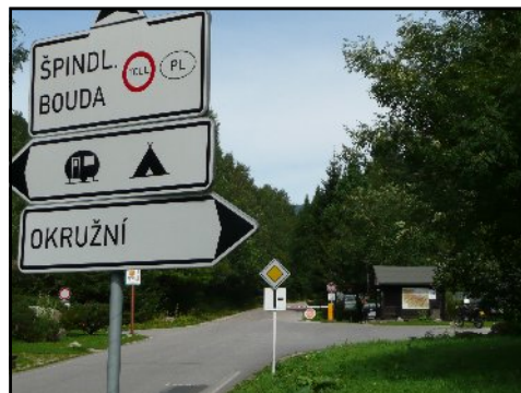
A toll road to Poland

Mid July: back in UK. Brands Hatch & S of UK , Nurburgring, Brno - then Czech Republic, Poland Germany and Dusseldorf show. Oct : NZ via Dubai/Malaysia/Thailand/Brisbane. May'09 back in UK via Tonga/Mexico/Cuba