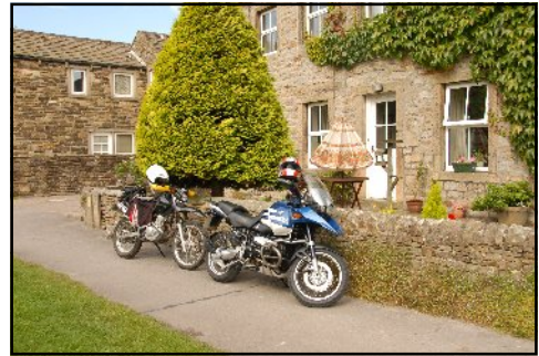
Breakfast in Dales BMW & Serow

Di rejoined me and we caught the night ferry from nearby Portsmouth to Caen in France, our theory was to get a long sleep but the ship was late loading us - bugger. We found a free Aire in Reims next to the new football stadium and then a wonderful site in Mesche in Luxembourg - the town itself isn't much but the scenery was at its very best. We picked up minor N257 and N410 and caught some of the Old Timer car event at the splendid Nurburgring circuit. I didn't enter the circuit but the buzz & sound was fantastic.