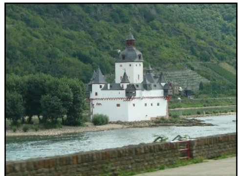
Marvellous River Danube