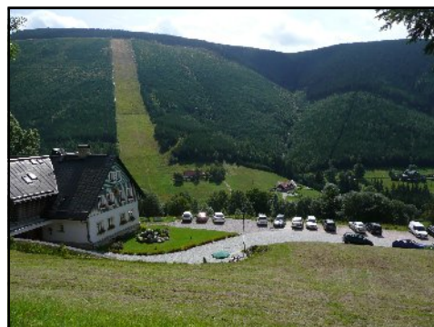
Ski run with no snow