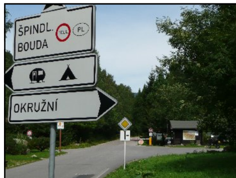
A toll road to Poland

Mid July: back in UK. Brands Hatch & S of UK , Nurburgring, Brno - then Czech Republic, Poland Germany and Dusseldorf show. Oct : NZ via Dubai/Malaysia/Thailand/Brisbane. May'09 back in UK via Tonga/Mexico/Cuba