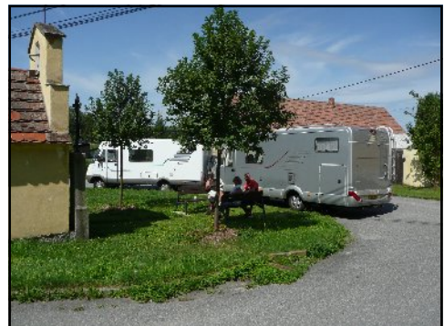
Coffee stop in Czech Rep