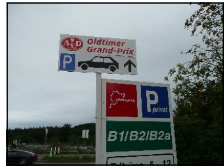
Nurburgring (S of Cologne)