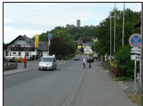
Nurburg looks quiet but LOUD

Mid July: back in UK. Brands Hatch & S of UK , Nurburgring, Brno - then Czech Republic, Germany and Dusseldorf show Oct : NZ via Dubai/Malaysia/Thailand/Brisbane. May'09 back in UK via Tonga/Mexico/Cuba