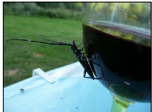
Friendly insect visited