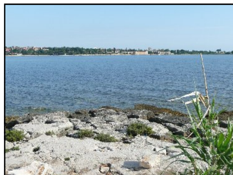
Adriatic coast Camping Umag