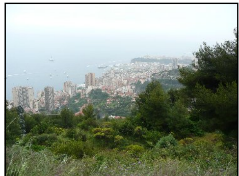
Monte Carlo on F1 day