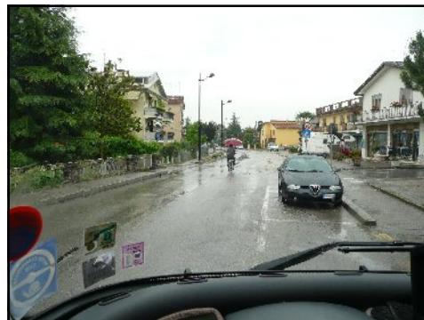
Italian cycling style!