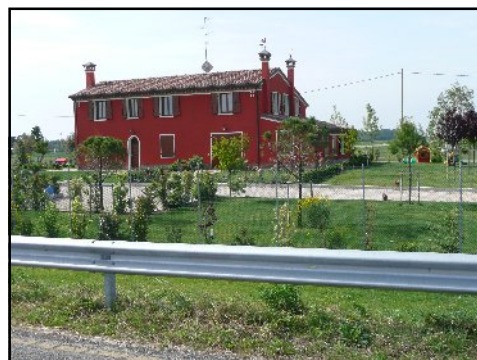
Typical new house