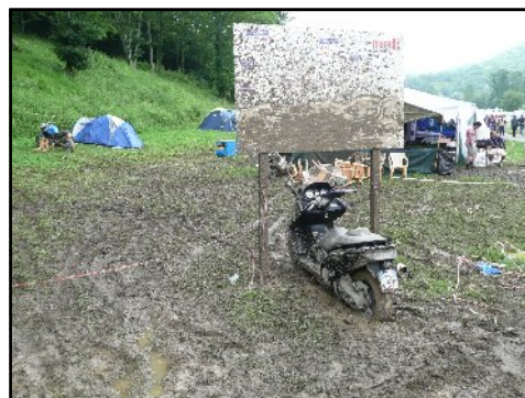
Muddy Mugello Circuit