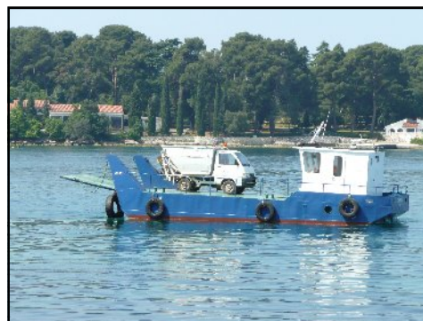
Mini ferry carries mini dustcart