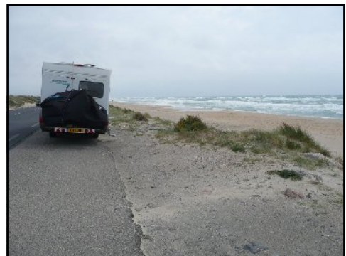
40mph winds—Sete, France