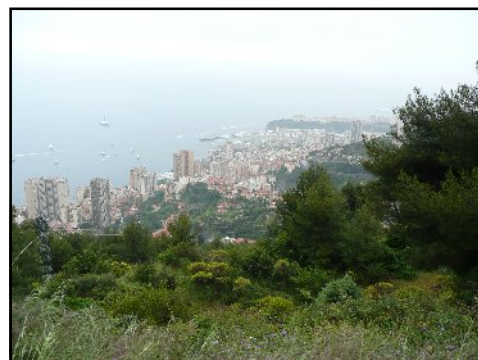
Monte Carlo on F1 day