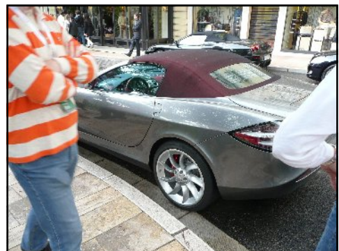
Flash cars and flash?

next travel plans: Europe May 20th in Mercie, Spain/France/Italy/Croatia/Slovenia/Austria Mid July: back in UK. Brands Hatch & S of UK Oct : NZ via Dubai/Malaysia/Thailand/Brisbane. April '09 UK via Tonga/Mexico/Cuba