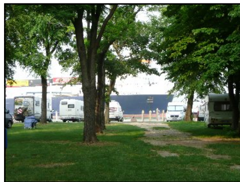
The big ships pass our site

next travel plans: Europe May 20th in Mercie, Spain/France/Italy/Croatia/Slovenia/Austria Mid July: back in UK. Brands Hatch & S of UK Oct : NZ via Dubai/Malaysia/Thailand/Brisbane. April '09 UK via Tonga/Mexico/Cuba