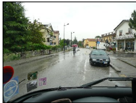
Italian cycling style!