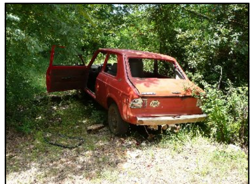
A rare sight in Croatia