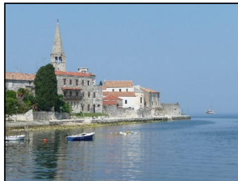
Porec on Istrian Peninsula

A week ago I got toothache, I got an appointment for the following morning, Sunday at 9am, by 9:10am I had a diagnosis, X-ray of the infected tooth and prescription. This was 14 pills for £10, at least the drug company made them look good value by making them big enough to choke an elephant. They seem to have worked so far—and the dentist didn't charge.