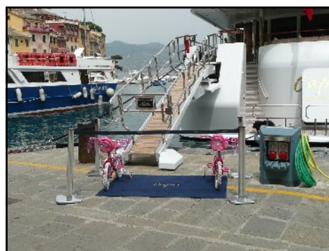
They're lovely Grandpa!

next travel plans: Europe May 20th in Mercie, Spain/France/Italy/Croatia/Slovenia/Austria Mid July: back in UK. Brands Hatch & S of UK Oct : NZ via Dubai/Malaysia/Thailand/Brisbane. April '09 UK via Tonga/Mexico/Cuba