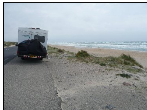
40mph winds—Sete, France