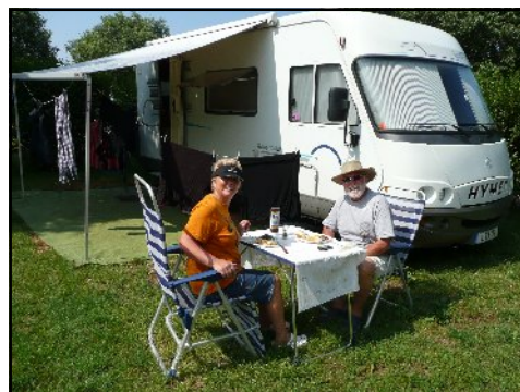
Breakfast at Camping Umag