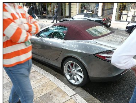
Flash cars and flash?

next travel plans: Europe May 20th in Mercie, Spain/France/Italy/Croatia/Slovenia/Austria Mid July: back in UK. Brands Hatch & S of UK Oct : NZ via Dubai/Malaysia/Thailand/Brisbane. April '09 UK via Tonga/Mexico/Cuba