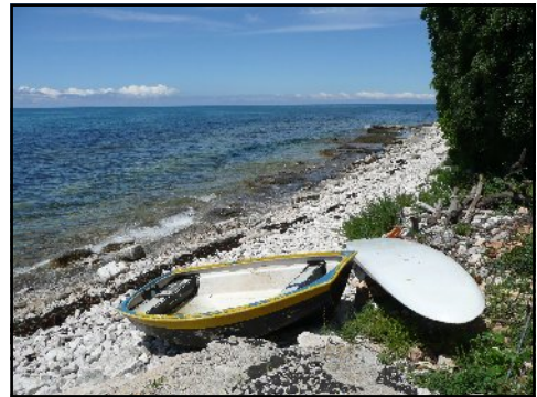
San Lorenzo on Istrian Peninsula

We took the scenic motorways A1/A2 to reach our next chosen site of Terme Catez in Slovenia. This is a big site with thermal pools and lots of aqua park playthings. We had learned of another general holiday (Slovenia Day) so we booked in here for 3 days. Once again this gave the chance of people watching. We have seen very few Brits or even people from countries other than Croatia and Slovenia. The motorcycling has been a great way to explore the small roads and my little bike is doing about 90mpg (20+km/litre) with over 3,000km ridden and only 10 months old it's great motorhome transport.