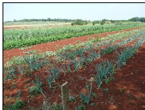
Soil makes good red mud too!