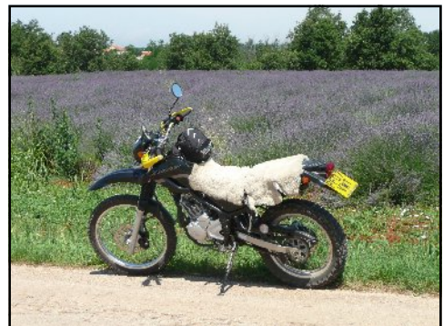
Field of lavender