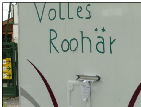
5 likely lads in rented camper

The ride back was even better in the scorching heat, we stopped to look at a new model Ducati 696 motorcycle, very stylish Italian, before having a beach cafe to ourselves to sip a Cappuchino coffee. The tunnels were a welcome cool going back - what a super day out. Di was ready to be taken to dinner at the surprisingly good camp restaurant, on the terrace.