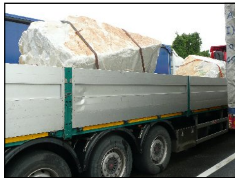
Carrara marble a la M. Angelo