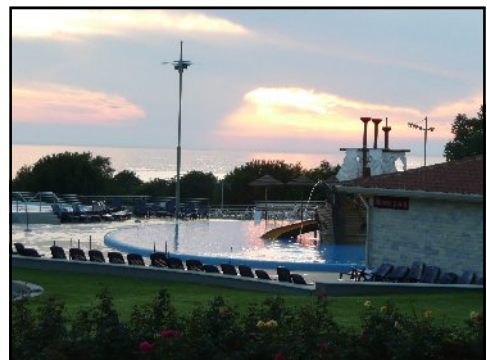
Evening at Camping Umag

Current travel : Spain/France/Italy/Croatia/ Slovenia/Austria/Czech/Germany/Holland Mid July: back in UK. Brands Hatch & S of UK Oct : NZ via Dubai/Malaysia/Thailand/Brisbane. April '09 UK via Tonga/Mexico/Cuba